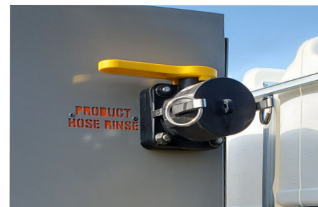
Flush and Rinse Product Hoses into Batch