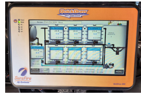
10" Ultra Bright Display