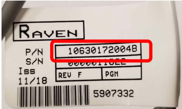
New Flowmeter sensor part number